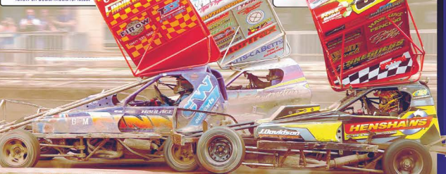
Genuine BrISCA BESTat OWLERTON SHEFFIELD Showin' Wide-a-Full Contact August 2019!

CHASE 2020 First Evening Drawback at BSCDA.com Ticket prices & On Sale dates theChase at www.Startrax.info Follow on Social Media for latest